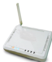
Outdoor wireless access points

Installing external wireless access points with indoor wireless repeaters is much faster than installing indoor wireless access points with cat-5/6 wiring to each one. The data/ power wiring is the most expensive and time consuming part of the installation.